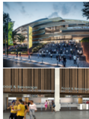
Sydney Football Stadium