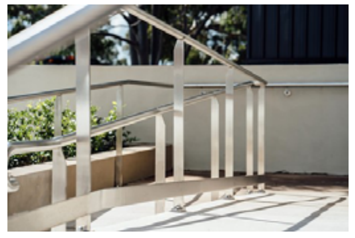
Grade 304: Stainless Steel Grade 304 resists rusting and corrosion, whilst offering durability.

Stainless steel is a durable, low maintenance material and is often the least expensive choice in a life cycle cost comparison.